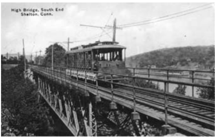
Postcard photo from the “Way We Were” calendar printed by the Healthy Valley.